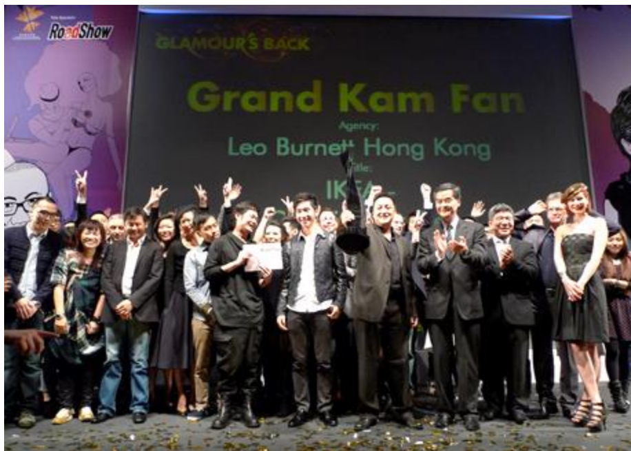
Leo Burnett HK taking the grand prize at Kam Fan 2010

HONG KONG - Leo Burnett Hong Kong won the Grand Kam Fan award for its 'Curtains: Trailer' for Ikea at the annual Kam Fan Awards held at the Hong Kong Exhibition and Convention Centre on Friday. A further 13 gold, 28 silver and 59 bronze awards were also presented.